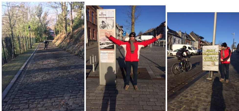
The Muur of Geraardsbergen